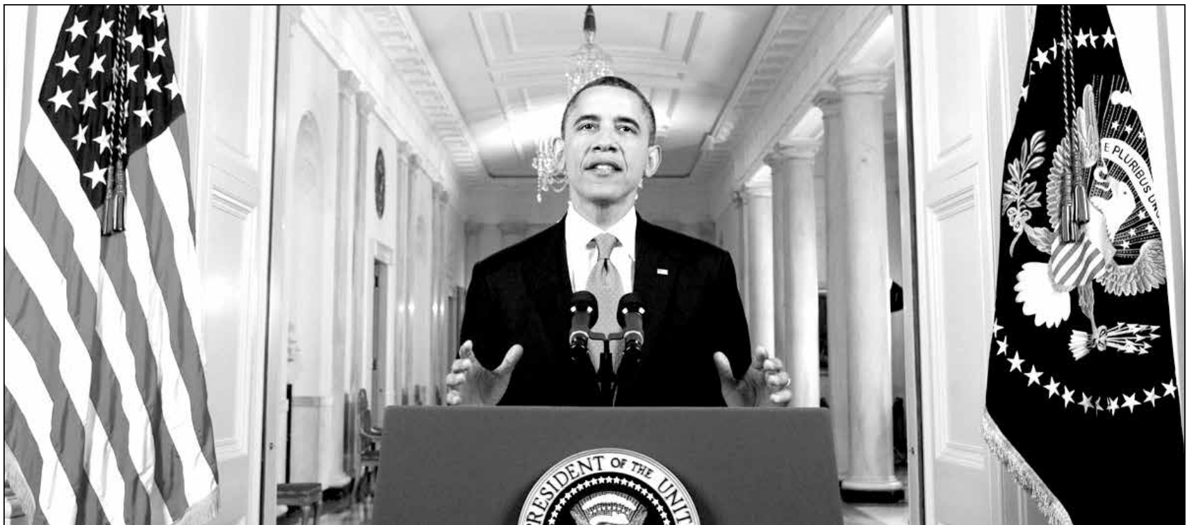
President Obama address American public after the ruling was announced by the Supreme Court upholding the constitutionality of the Affordable Health Care Act.