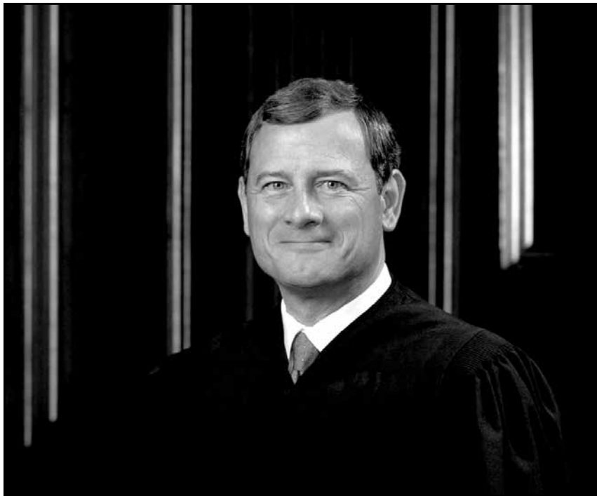
United States Supreme Court Chief Justice John Roberts

Cover Story, Continued from previous page.