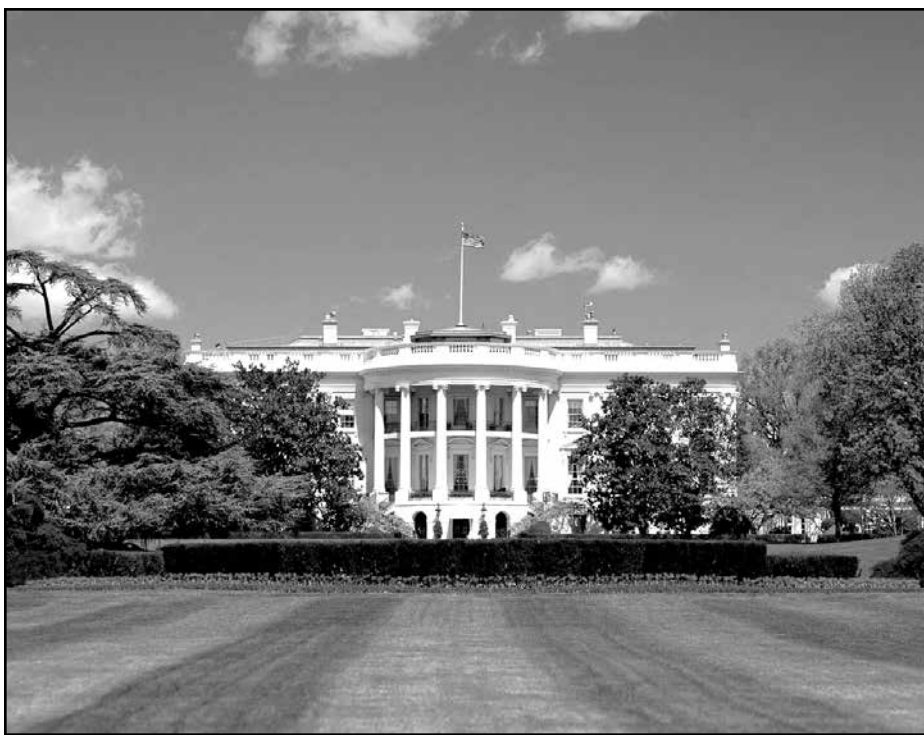
The White House

As a city, state and nation get ready for elections, we at Data News Weekly in our mission as the “People’s Paper” strive to be the primary source for providing information that will help our citizens make informed choices when they head into the polls on Nov. 6th. In the upcoming issues we will provide information about voting as well as interviews with candidates in races going on across the City. We encourage our citizens to get