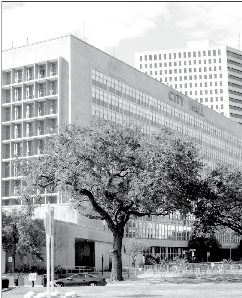
New Orleans City Hall

Cover Story, Continued from previous page.